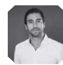
Mathieu Flamini International footballer