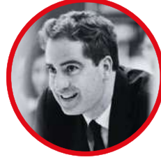
Olivier Becht Member of Parliament for Haut-Rhin - Alsace Former Minister Delegate for Foreign Trade