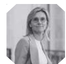
Agnès Pannier-Runacher Minister of Ecological Transition