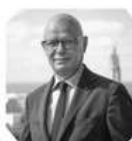
Edouard PHILIPPE Former Prime Minister Mayor of Le Havre